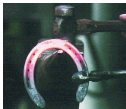
Left: Prepare for first hit, locking shoe against the horn. Center: Reverse shoe, notice blow coming straight down. Above right: Third hit straightens branch. Far right: Reverse shoe again to make final blow to straighten second branch.