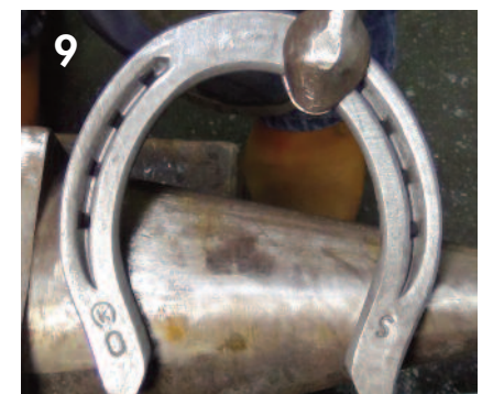
PHOTO 1: Starting on horn, using FootPro rounding hammer. PHOTO 2: Extension is nearly set. PHOTOS 3 AND 4: Heel Check is now adjusted, also on the horn. PHOTOS 5, 6 AND 7: Second heat taken to work opposite heel. PHOTO 8: Heel Check put in. PHOTO 9: Extension finished.